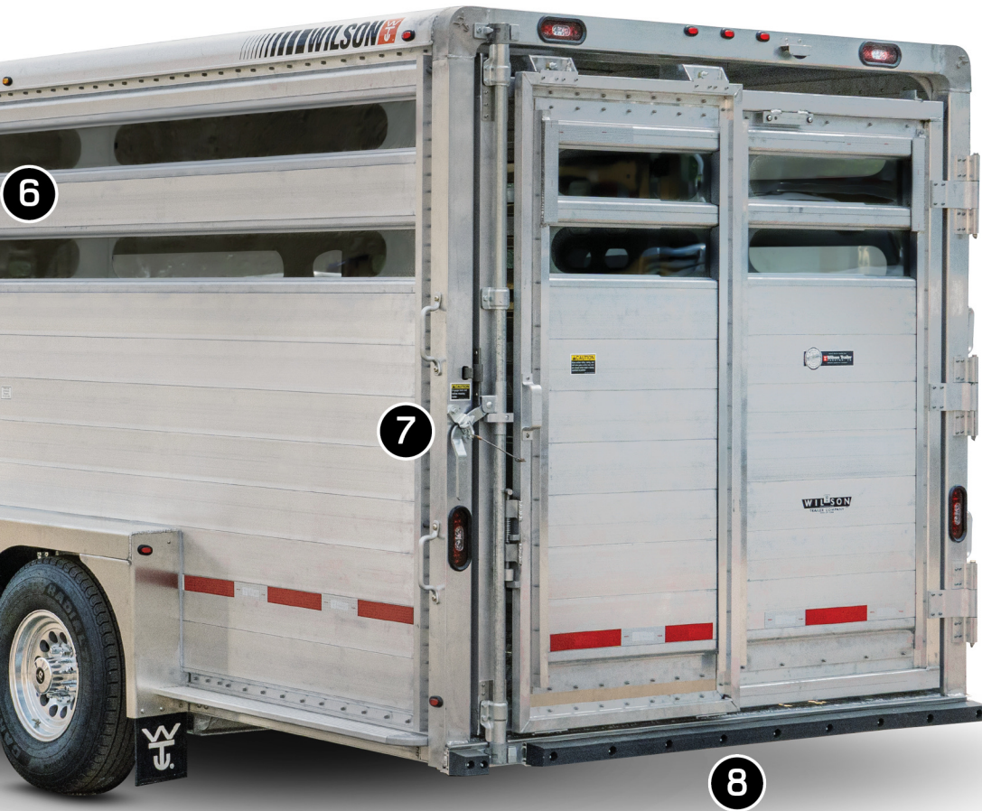
Ranch Hand 5724 model pictured above.