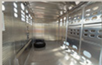
Full-width 84" interior.