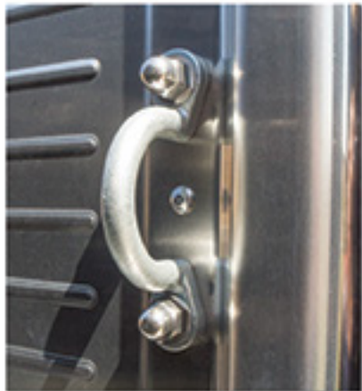
Outside Tie Loops