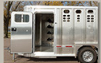
Large tackroom side door with full-length running boards.