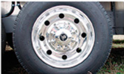
Alcoa Aluminum Wheels