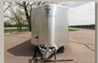
One-piece formed V-nose - no seams

You will feel confident knowing Wilson's superior quality, durability and lowest cost of ownership has been built-in to the structure of the trailer and not added on.