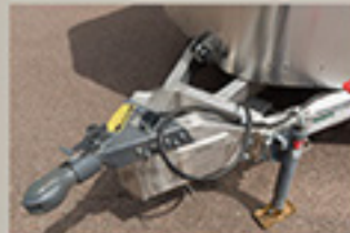
The beefy aluminum A-frame coupler provides strength to the trailer where it is important.