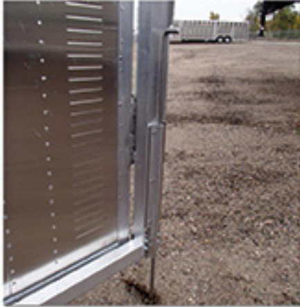
Rear Door Prop Rod