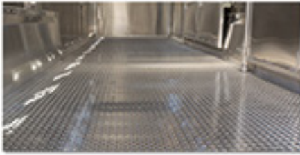
.110 Thick Flat Tread Plate with Crossbars on 6" Centers