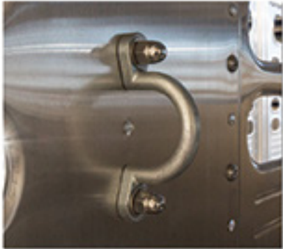
Inside Tie Loops