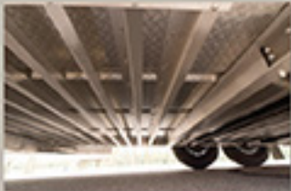
All aluminum sub frame with 6" cross bar spacing. The best floor strength in the industry.